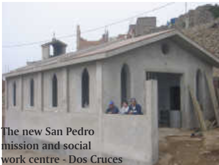
The new San Pedro mission and social work centre - Dos Cruces

We plan to build four new centres in areas of extreme poverty in the south of Lima. All will be multi-purpose, including a space to be used for worship and service of whatever sort the local community needs - a day care centre for children, a soup kitchen, medical centre, a pharmacy, etc. The first one, San Pedro, (photo left), is almost completed and the Municipality is keen to give us land in San Francisco de la Cruz, San Gabriel, and La Rinconada - an area of extreme conditions, 20,000 people and no facilities.