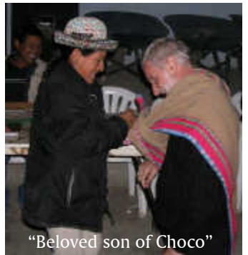
"Beloved son of Choco"