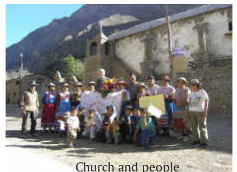
Church and people