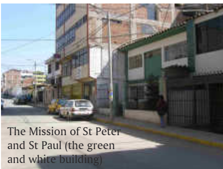
The Mission of St Peter and St Paul (the green and white building)