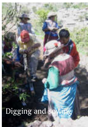
Digging and sowing