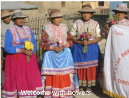
Welcome with flowers