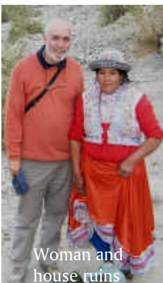
Woman and house ruins