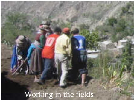
Working in the fields